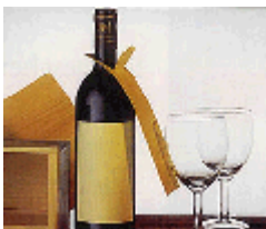
LANDOLIUM Hulshout 0032(0)15/222911