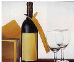
LANDOLIUM Hulshout 0032(0)15/222911