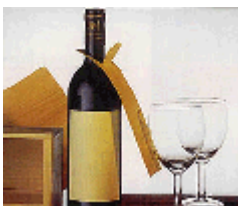
LANDOLIUM Hulshout 0032(0)15/222911