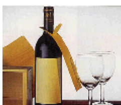
LANDOLIUM Hulshout 0032(0)15/222911