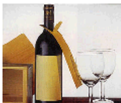
LANDOLIUM Hulshout 0032(0)15/222911